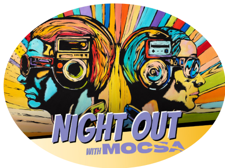
Artwork courtesy of The Patrons